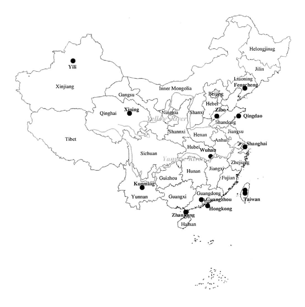
Figure 1 Geographic locations of the Han samples under study